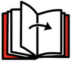
turn the page