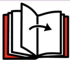
turn the page